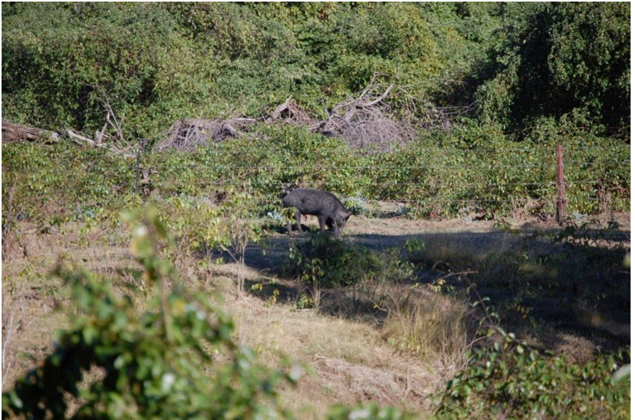
What do you do after you have hunted your trophy and your management hinds, it was walking the creeks for some pigs, they just did not want any time off.